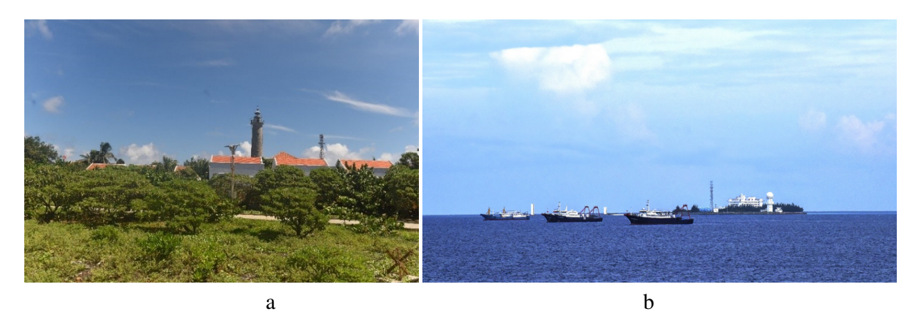
Fig. 4. Class of island/cay landscape on the Truong Sa Islands, Vietnam: a — mixture of specific purpose structure with indigeneous and exogeneous plants on the Song Tu Tay (Southwest Cay) of the Song Tu (North Danger) Reef; b — military-grade structure and exogeneous plants on the artificial Huy Go (Hughes) Island of the Sinh Ton (Union) Bank

recently due to anthropogenic activities. At the time of the study, the soil layer of cay / vegetated cay was either autochthonous and was altered alongside construction installations onto surface substrates, or allochthonous from exogenous material, such as manufactured soil from the mainland to improve self-sufficient capability of local communities. Current land covers of such features are the mixture of flora communities including both indigenous and exogenous species (migrated from the mainland), such as Barringtonia asiatica , Calophyllum inophyllum , Coccoloba unifera ), Casuarina equisetifolia , Heliotropium foertherianum , Terminalia catappa , Morinda citrifolia , Cocos nucifera , Scaevola taccada , and constructions (buildings, concrete roads, and structures for specific purposes) (Fig. 4a). Artificial islands are reclaimed areas, composed from dredged reefal material exploited on nearby reefs and lagoons. Land covers of artificial islands are constructions (civil and military structures) and exogenous flora communities (Fig. 4b).