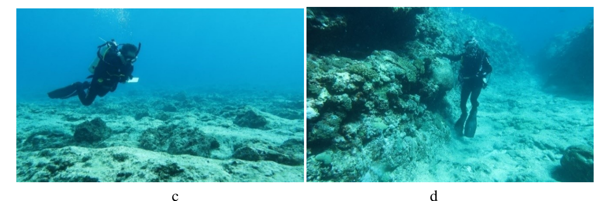
Fig. 5. Upper Epipelagic (0–100m depth) landscapes of the Truong Sa Islands, Vietnam: a — coral communities on the reef front of the Sinh Ton (Sin Cowe) Island reef, Sinh Ton (Union) Bank; b — seagrass meadows on the Nam Yet (Namyit) Island reef, Nam Yet (Tizard) Bank; c — coral platform sculptured by parallel, shallow grooves on the Song Tu Tay (Northwest) Cay reef, Song Tu (North Danger) Reef; d — 2.5–3 m grooves of the Toc Tan (Alison) Reef

distributed across the reef, and commonly observed on the reef of Song Tu Tay (Northwest) Cay (Fig. 5c). Spurs and grooves (SaGs) formation of various sizes and depths appear on the open ocean side of shallow reefs (such as Truong Sa (Spratly) Island, Sinh Ton (Sin Cowe) Island, Da Lon (Discovery Great) Reef, Toc Tan (Alison) Reef), vary from 1–4 m of width, less than 1m to approx. 6 m of height (Fig. 5d). SaGs tend to appear on the north-northwest side of reefs, implying the influence of predominance of wind-wave hydrodynamic in the study area.